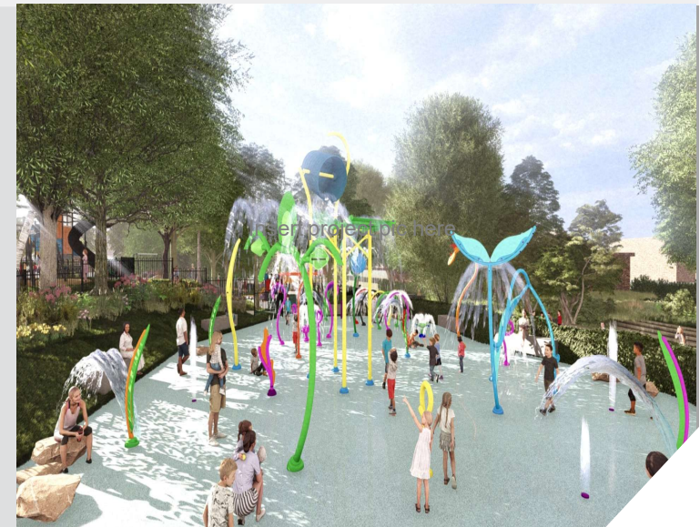
New Splash Pad Image