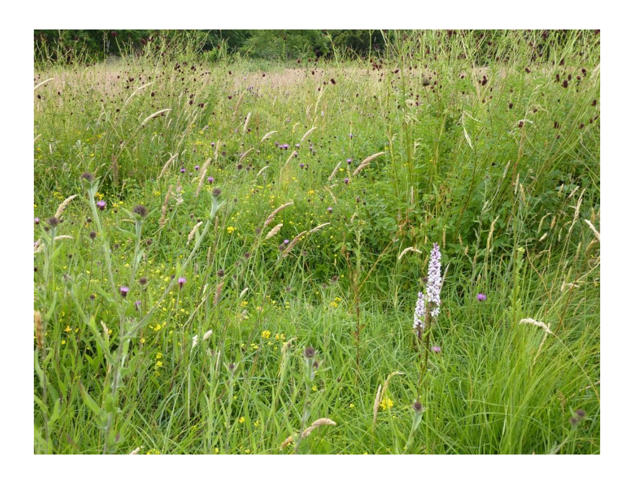
Part 1 - An overview of Local Wildlife Sites in Nottinghamshire

Produced by the Nottinghamshire Local Sites Panel